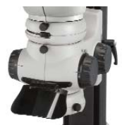
Step magnification multiplier