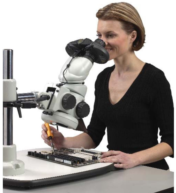
Alpha boom mount with optional fixed angle viewer.

Crank handle option allows convenient vertical adjustment when frequent changes in working distance are required.