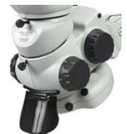
Fixed angle viewer