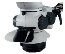
Oblique and direct viewer