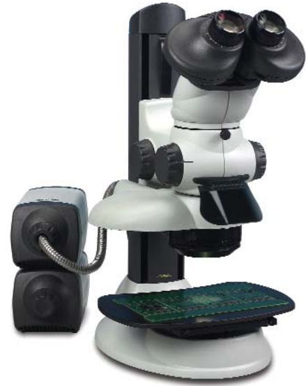
Alpha bench stand with optional oblique and direct viewer.