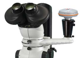
Image capture and archive